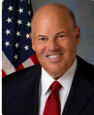
Louis DeJoy Postmaster General & CEO U.S. Postal Service

Crime: Obstructing the distribution of mail, sabotaging Democracy.